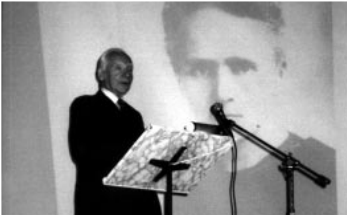
Sir Joseph Rotblat addresses Marie Curie fellows at the MCFA thematic conference.

This article is based on Sir Joseph's presentation at the Thematic conference.